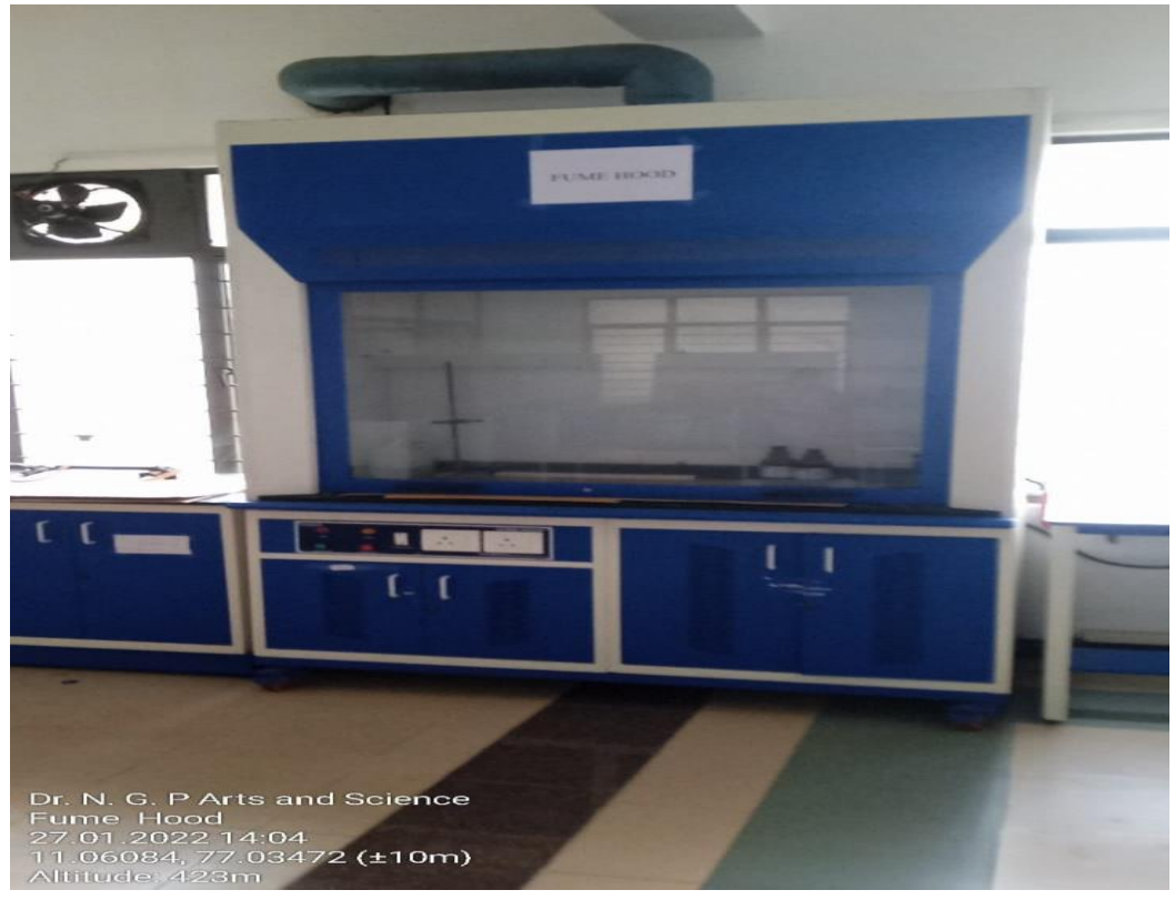
Fume-hoods used to handle concentrated acids in Chemistry Lab

The following are the geotagged photographs of Hazardous Chemicals and Radioactive Waste management facilities at the institution: