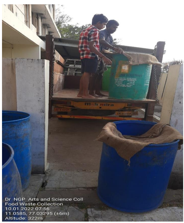
Food Waste Collected from Hostels by M/s. Nagaraj Mini Pig Farm