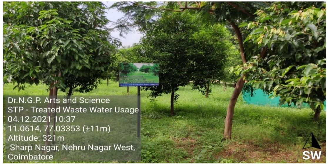
Gardening Using Treated Waste Water in the Campus