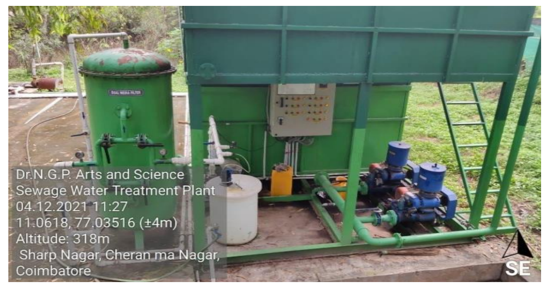
Waste Recycling System for Liquid Waste Treatment

The following are the geotagged photographs of Waste Recycling System facilities at the institution: