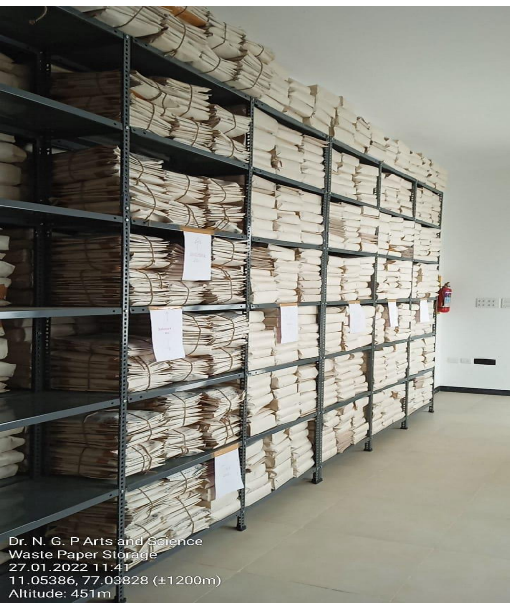
Paper Waste Storage Area for Disposal