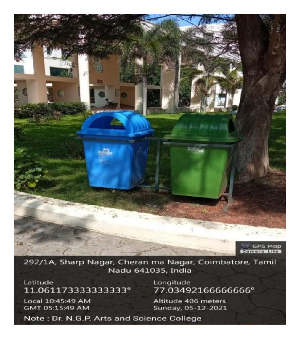
Solid Waste Collection Point available at various places in Campus

The following are the geotagged photographs maintained for Solid waste management in the campus: