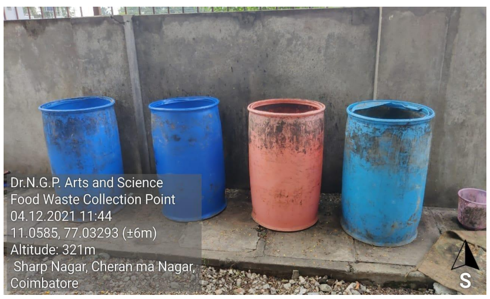
Food Waste Collection Points in Hostels and Cafeteria