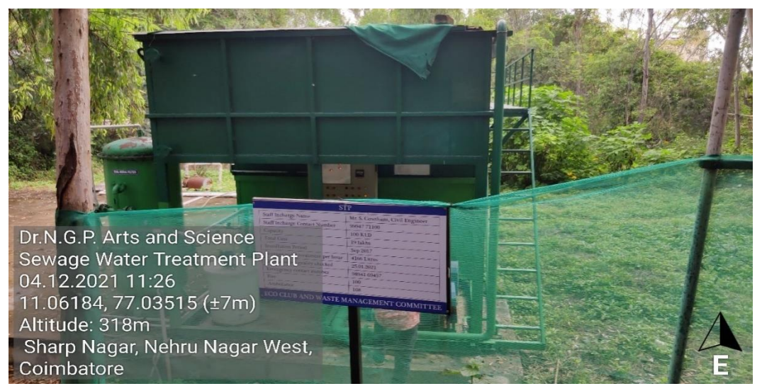
Sewage Water treatment plant in the campus

The following are the geotagged photographs of Liquid Waste management facilities at the institution: