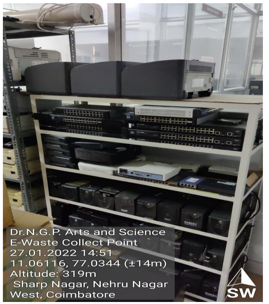
E-Waste Collection Point for Disposal

The following are the geotagged photographs of E-Waste Waste management facilities at the institution: