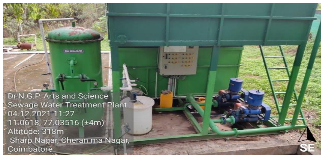
Sewage Water Treatment Facility in the campus